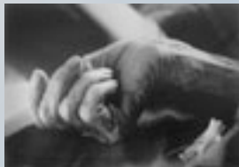
A Tired Hand