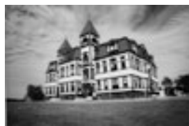
Lunenburg Academy

crowds of tourists walking in and out of his viewfinder. Look carefully and you'll see two or three tourists in the distance. No longer domi-