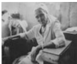
Ancient Lady