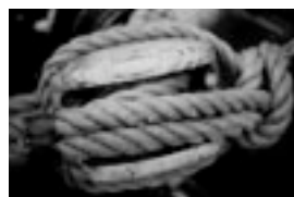
Line Through Wooden Block © Christopher Nolan

His shots of hawsers wrapped around the bollards of the wharf, or of rope tracing though a double wooden "block" or pulley , are simple, yet tell tales of other times.