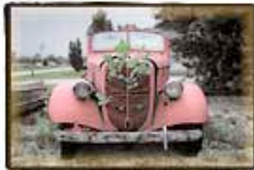
Abandoned Fire Engine, Kentucky

Combine the warmth and beauty of the platinum/palladium print with the precision of digital negatives, all in the same workshop. From digital capture or scan to the final print, learn all the steps to crafting beautiful handmade prints. More than a make-a-negative-and-print-it session, we'll delve into the exciting world of High Dynamic Range imaging (HDR), learning to capture—and print—lush shadow detail, delicate highlights and glowing midtones.