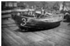
One of the First Images

Perhaps with a less discerning eye than he has today, he photographed whatever caught his attention, then took the roll of film home.