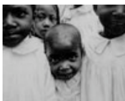
Curious Children © Christopher Nolan

shadow of what seems to be a truck. The third is of four or five small children crouching, tightly grouped, and barely three feet from the lens. Nolan had been changing his film and after closing the camera back looked up to a sea of innocent smiling and laughing faces. Talk about “ the decisive moment! ”