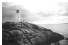
Lighthouse at Sunset

None of his photographs of the waterfront are "happy accidents." Sometimes he waited for hours to get the shot he had in his mind's eye. For example, his photograph of a lighthouse at the top of a rocky shore was taken late in the day when the rocks were darkened by failing light, but no longer overwhelmed with