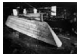
Building a Dory

Chris photographed all of this. Then, when his negatives and prints were destroyed in a fire, he went back many years later and photographed it again, trying to capture what he realized was an art, slowly dying. Relying on available light alone, Chris captured the mood of the workshop, and with it the sense of history implied by rugged workbenches, tools with wooden handles, the smell of tar used to seal joints and the paint to protect wood from the open ocean.