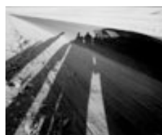
Shadows in the Sand